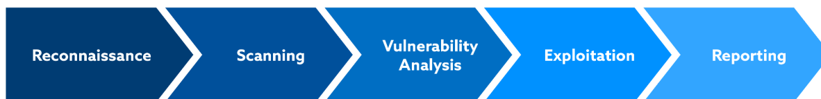
Figure 1: Offensive Security Testing Phases

While the techniques, breadth, and depth of testing vary across offensive security engagements, intrusion typically follows five phases: Reconnaissance, Scanning, Vulnerability Analysis, Exploitation, and Reporting. Before commencing any engagement, it is crucial to create a Statement of Work (SoW) or a scope statement and establish the rules of engagement. These foundational documents set the stage for the five phases shown. For the remainder of this paper, we discuss these five phases, while assuming the scope and rules of engagement have been defined.